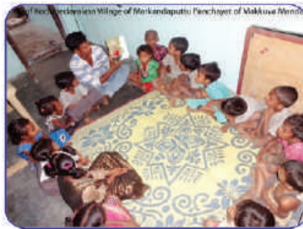
CIC of Kodupedavala Village of Markandapattu Panchayat of Malakka Mandal