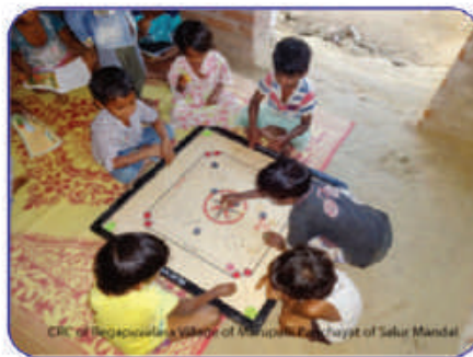
CIC of Bogavala Village of Marupatti Panchayat of Sakur Mandal