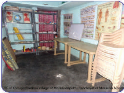
CIC of Kodupedavala Village of Markandapattu Panchayat of Malakka Mandal