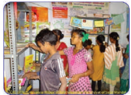
CIC of Kodupedavala Village of Markandapattu Panchayat of Malakka Mandal