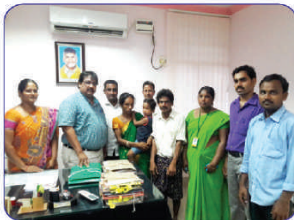
Hand over to Parents