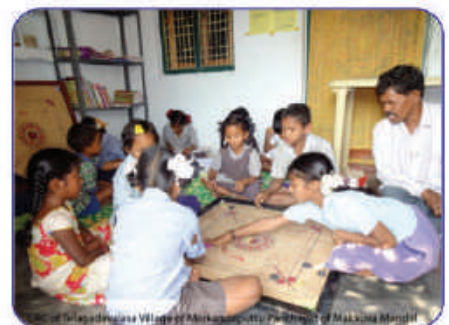
CIC of Kodupedavala Village of Markandapattu Panchayat of Malakka Mandal