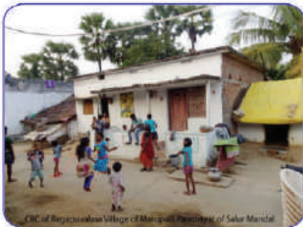
CIC of Bogavala Village of Marupatti Panchayat of Sakur Mandal