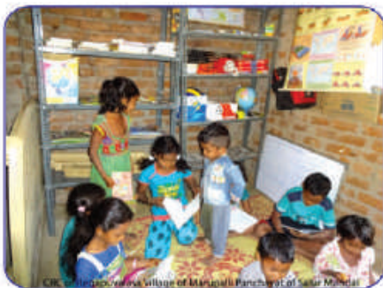
CIC of Bogavala Village of Marupatti Panchayat of Sakur Mandal