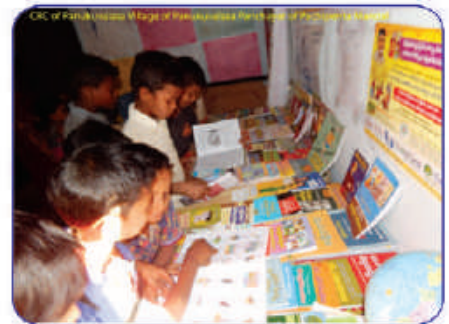
CIC of Panikudavala Village of Panikulasseri Panchayat of Perambalur Mandal