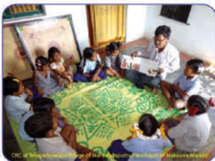
CIC of Kodupedavala Village of Markandapattu Panchayat of Malakka Mandal