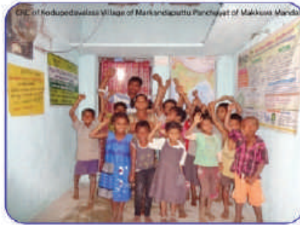
CIC of Kodupedavala Village of Markandapattu Panchayat of Malakka Mandal