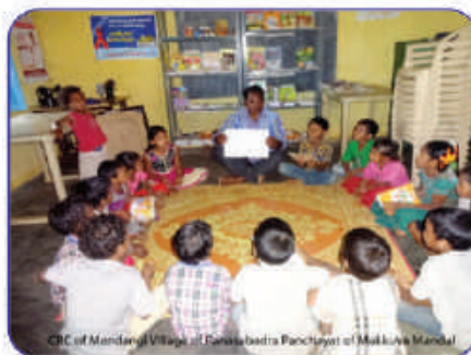
CIC of Mandavil Village of Panikudavala Panchayat of Malakka Mandal